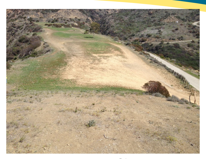
New Tank Site