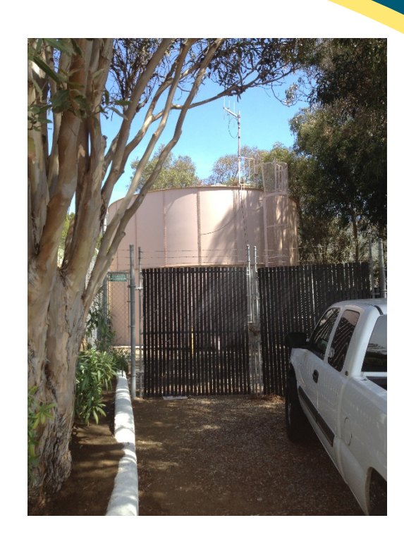
Existing Sweetwater Tank