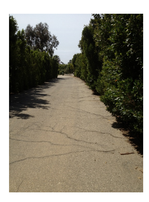
Pipe along Sweetwater Mesa Road